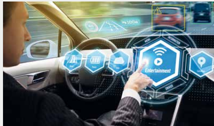
APP STORE Flexible app platform for an evolving market