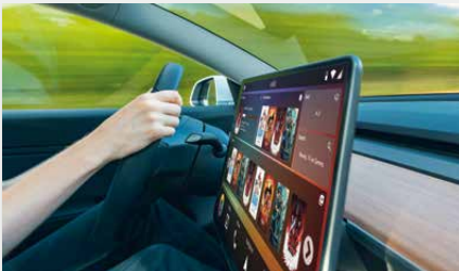
CONTENT HUB Connected car is the next entertainment screen

Delivering entertainment to connected cars is about more than technology. Automotive OEMs need to provide a wide content portfolio to drivers and passengers.