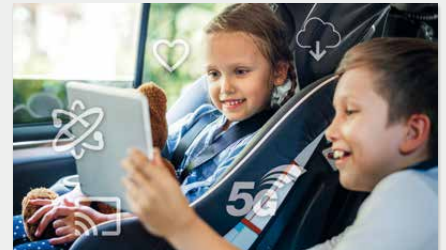
CONNECTIVITY Car entertainment, TV streaming and audio